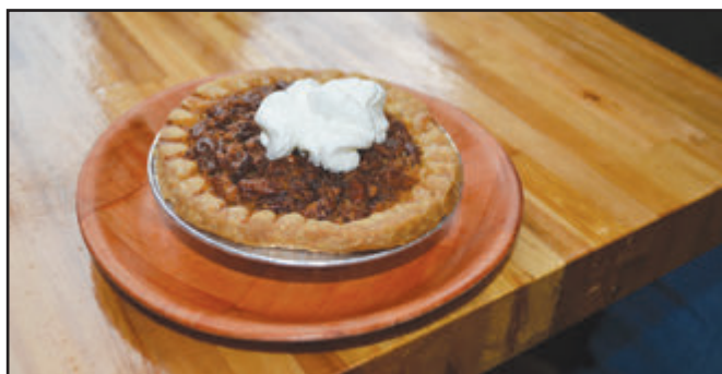
KY Bourbon Pecan Pie, baked fresh daily from Bean Haus Bakery & Cafe, 640 Main Street, Mainstrasse