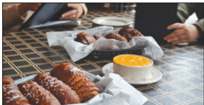
Locally sourced German Bavarian pretzels served with homemade beer cheese dip from Cock & Bull Public House, 601 Main Street, Mainstrasse